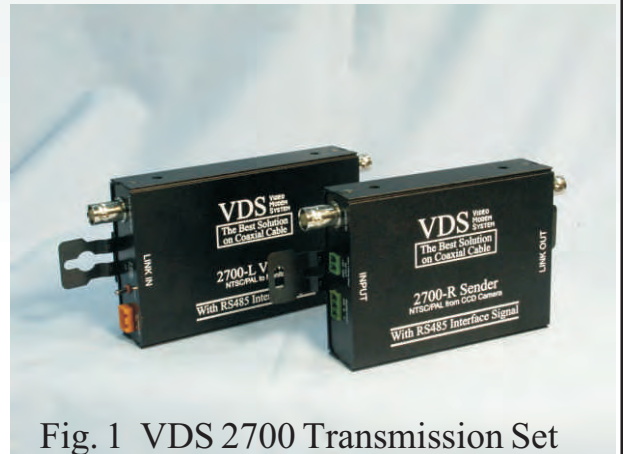
Fig. 1 VDS 2700 Transmission Set

By using inter-carrier technology, VDS 2700 provides an innovative transmission method, simple installation and the highest quality picture transmitted for CCTV system.