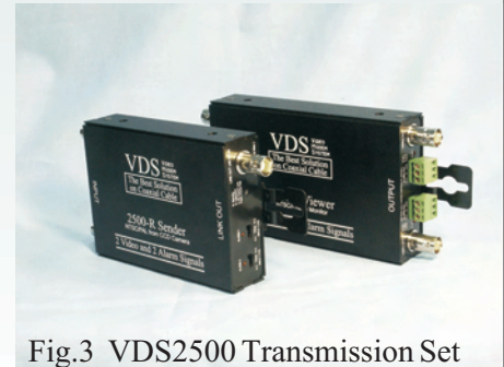
Fig.3 VDS2500 Transmission Set